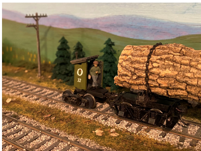
1st Place Virtual