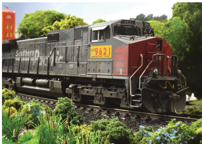
1st Place Virtual