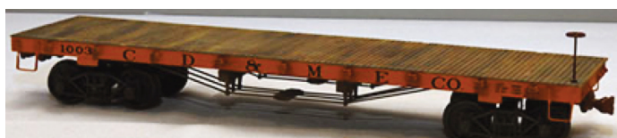
1st Place Scratch Traction – Jim Kehn, MCR, CD&ME Co. 1003 Traction Flatcar