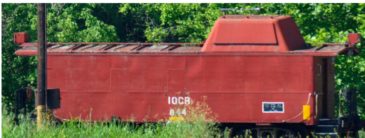
IOCR #844 Jim's old caboose

86 foot Hi-Cube boxcars. Basically, we would take 9 MT (empty) cars from the DC to the manufacturing plant (Plant 1) downtown and swap them out for nine loaded cars. This was about a 3-mile trip. We used the caboose as a shoving platform because it had lights and an air horn. The job was to take around 2 hours. We would finish back at the DC and then head back downtown. We then worked the other side of Plant 1 placing cars of raw materials (sand, soda ash, limestone) and pulling MTs. The next stop was out on the old PRR where we serviced Ralston Foods. We would head back to the DC when we finished. We waited for them to unload the boxcars and then do a second shuttle. This was a normal day for the L-1 (Lancaster Job 1).