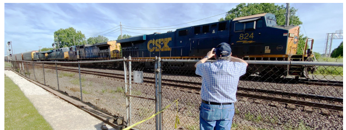
Rail Fan - Rail Fanning