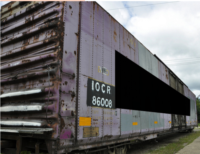
IOCR 86008 AH shuttle car Logan OH Sorry, we have a mixed audience