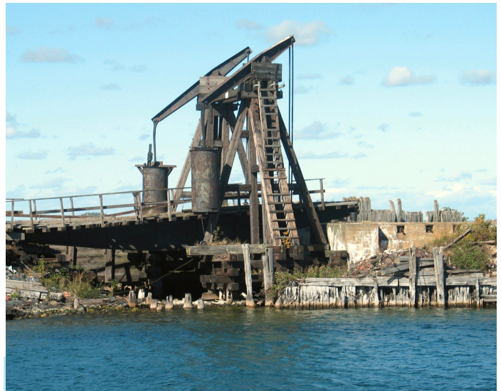
1st Place Virtual