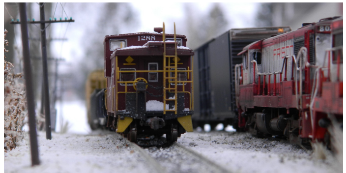
1st Place Virtual