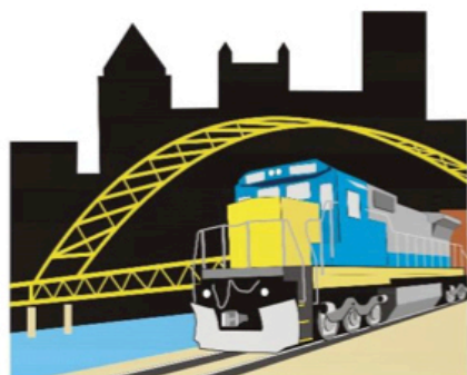
RAILS TO PITTSBURGH 2023