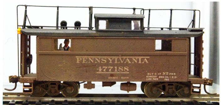
1st Place Model