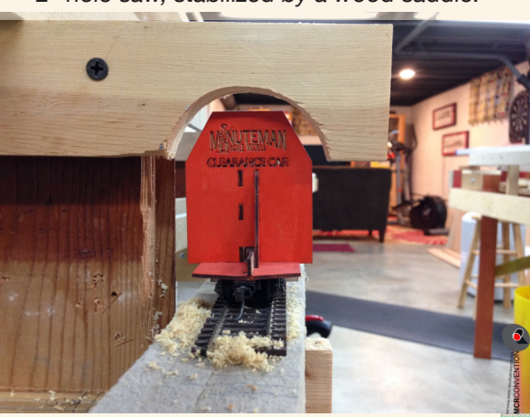
2" hole saw, stabilized by a wood saddle.

This is a super simple tool that solved a problem I thought was going to be much more complicated to resolve.