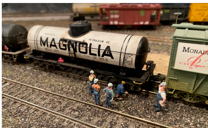
1st Place Virtual Photo by Howdy Lamprecht Copyright by the entrant