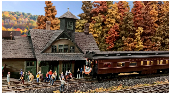
1st Place Virtual