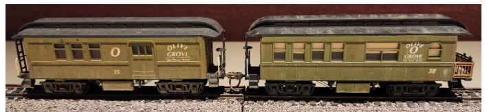
1st Place Model by Howdy Lamprecht