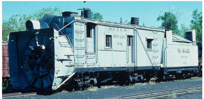
1st Place Virtual