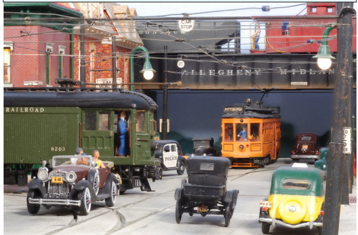
1st Place Virtual