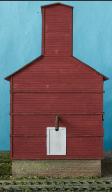
1st Place Model by Greg Short