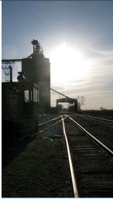
1st Place Virtual Photo by Darrell Logan Copyright by the entrant