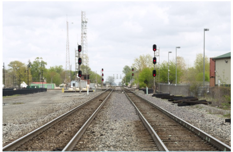
1st Place Virtual