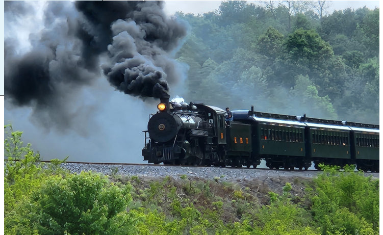
1st Place Virtual Photo by Butch Sage Copyright by the entrant