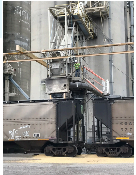
1st Place Virtual Photo by Matt Goodman, Copyright by the entrant