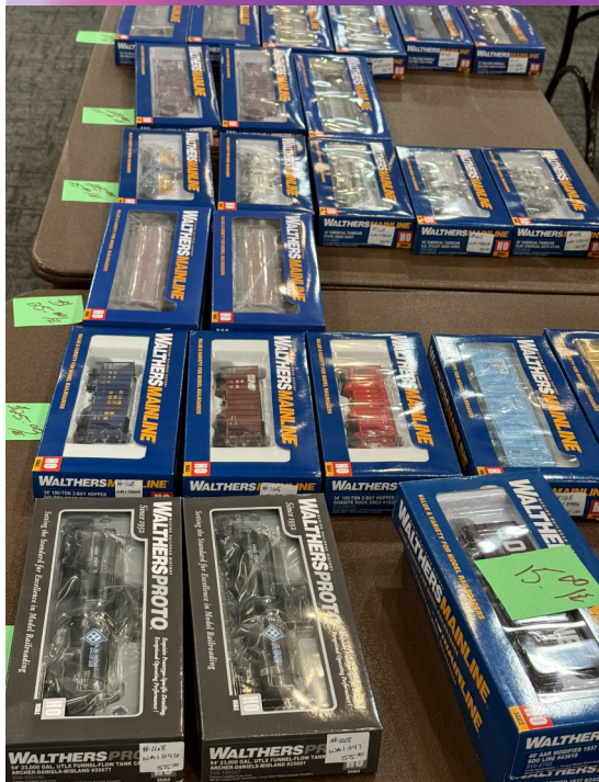
An array of Walther's models for sale during the Train Show.