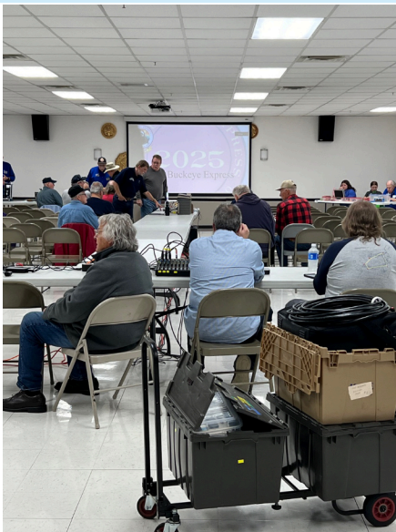
Division 7 Meeting with our Buckeye Express on the Screen