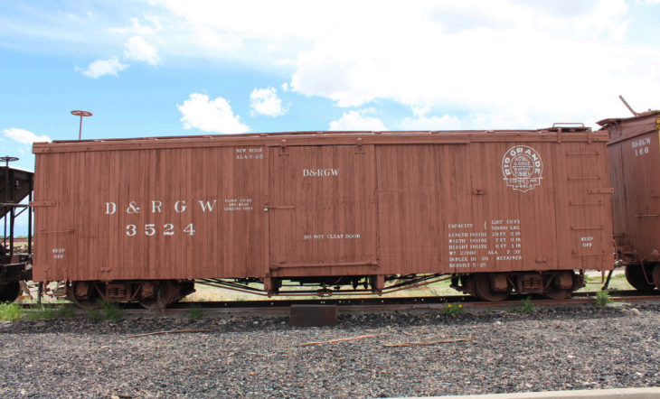
1st Place Virtual

Thanks for entering the contests, and congratulations to the winner.