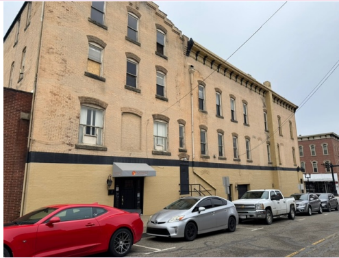
The Cambridge Club building