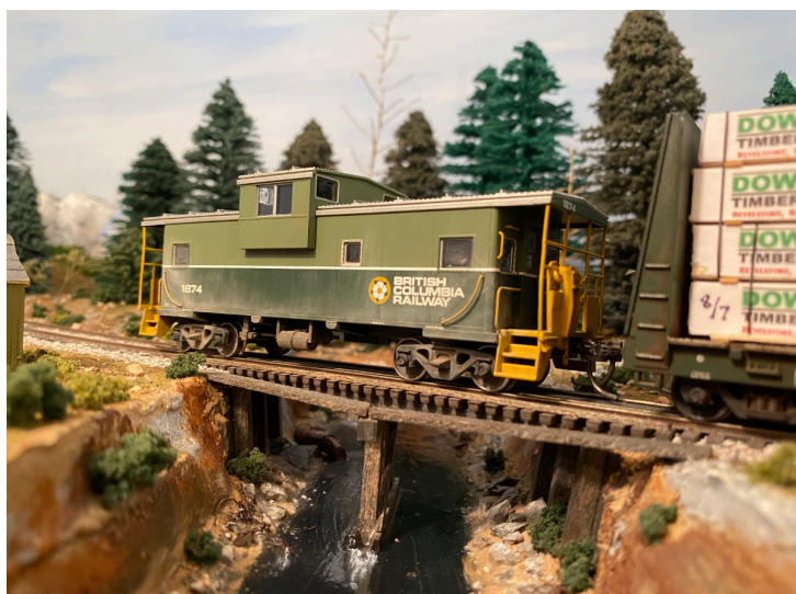
1st Place (Tie) Virtual Photo by Howdy Lamprecht, Copyright by the entrant