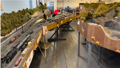
The Cambridge Club