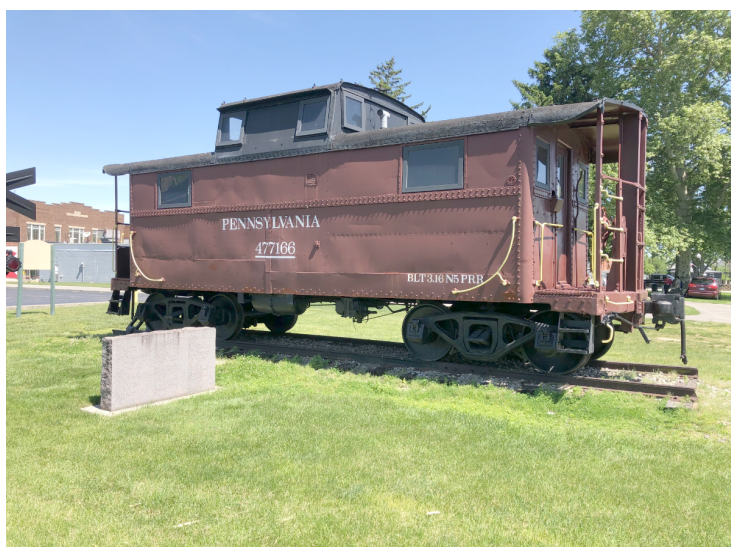
1st Place (Tie) Virtual