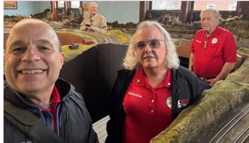
The Cambridge Club