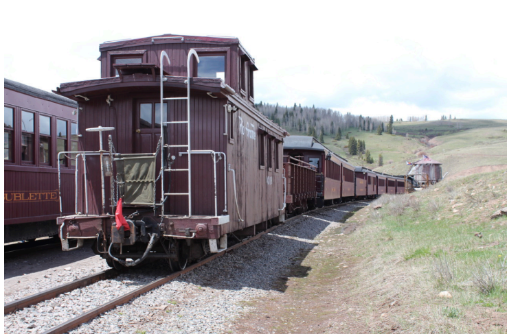
1st Place (Tie) Virtual