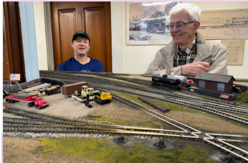
The Cambridge Club